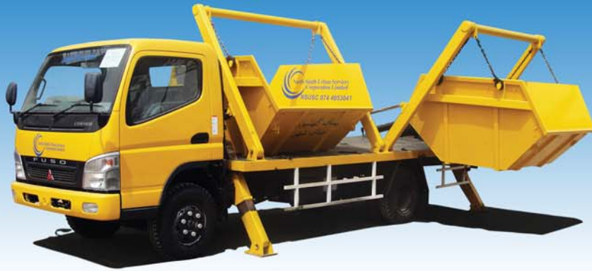
Side Skip Loader